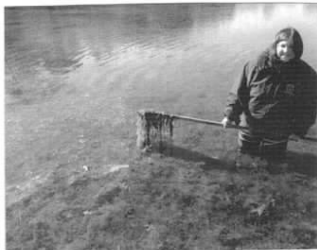
Hydrilla in Long Pond's East Basin in 2001

Thankfully, the very successful annual Sonar treatment programs initiated in 2002 have returned Long Pond to its original beauty and have served to keep it that way.