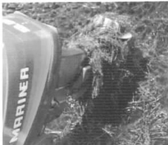
Hydrilla caught on an outboard motor in Florida

And lest we forget, this is what hydrilla infestation looks like: